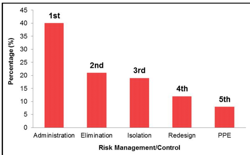
Fig.1. Risk Management in Distribution of Petroleum Products

petroleum products and leakages of petroleum products from tankers. Moreso, isolation control measure of risk was ranked third which involves removing people or workers away from the risk source. This has played a vital role in reducing risk of fire and explosion of petroleum products and leakage of pipelines. Consequently, the redesign risk control measure ranked fourth, which involves changing the working environment or work processes that provide an additional protective barrier between the risk and the employee. This has reduced risk from poor vessel programming of pipeline, technological/operational error and mechanical failure. Finally personal protective equipment (PPE) risk control measure was ranked least which is majorly being used to control risk of natural hazard during the pipeline operations.