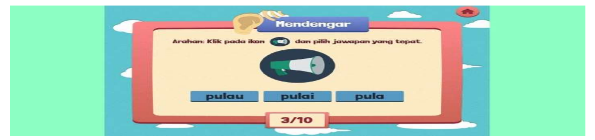
Fig.4. Listening module of word "island"

Sort the numbers and alphabet in ascending and descending order. The print screen of the test is as Fig. 10 and Fig. 11.