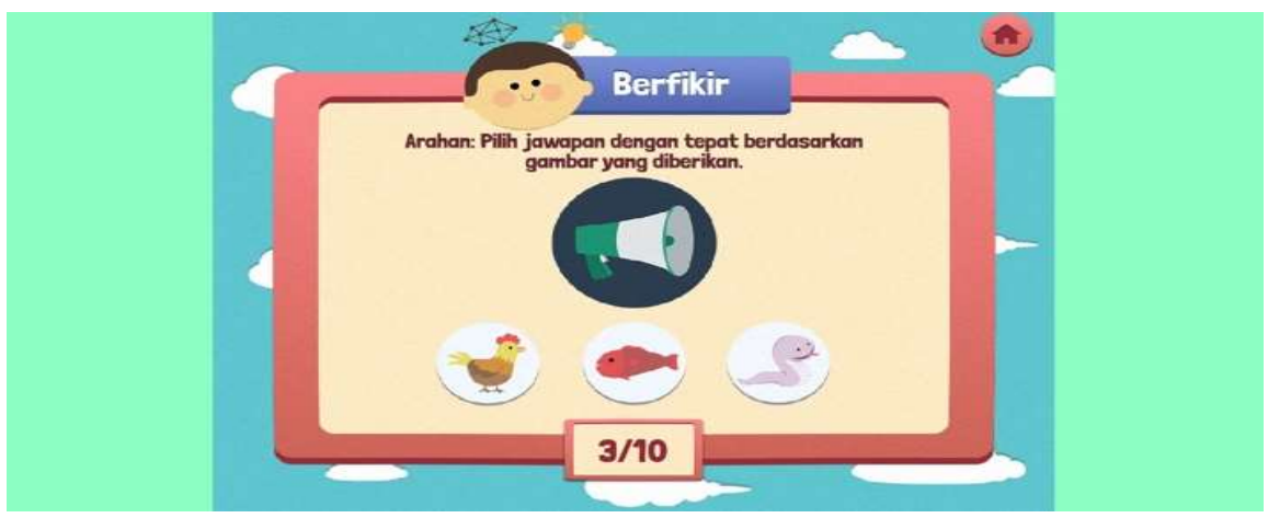
Fig.9. Thinking module of a sound