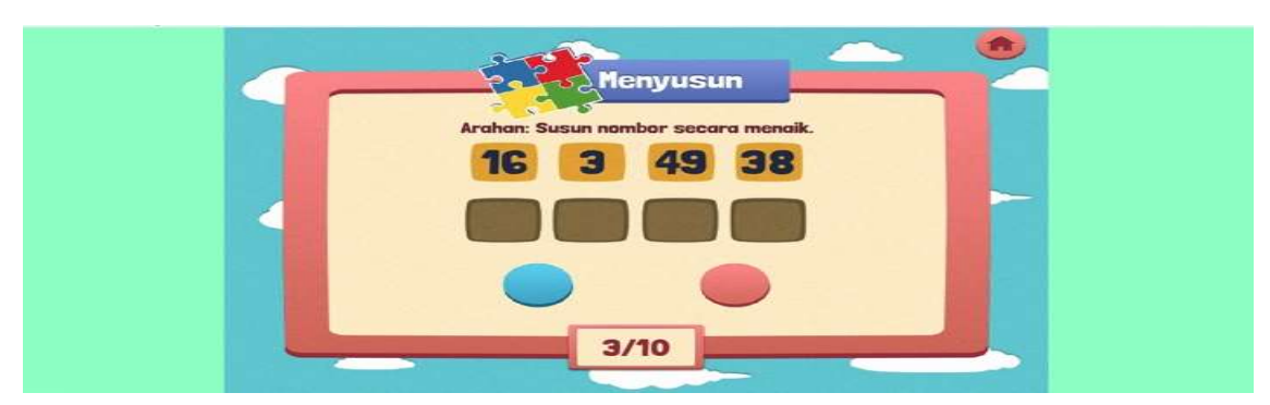
Fig.10. Sorting module of a set of numbers in ascending order