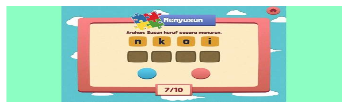
Fig.11. Sorting module of a set of alphabet in descending order