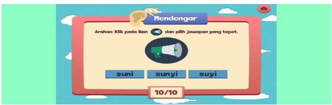
Fig.6. Listening module of word "quiet"