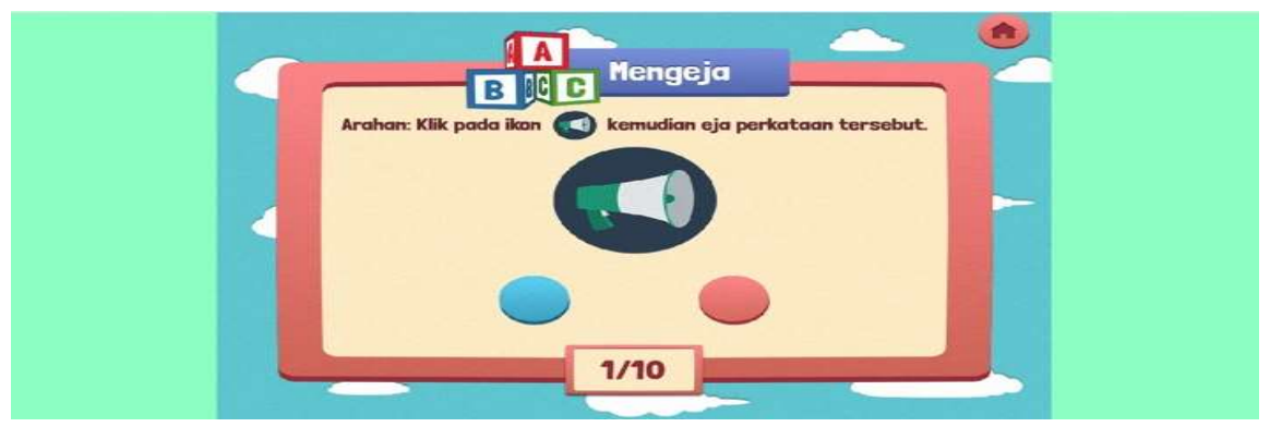
Fig.7. Spelling module of words "anchor", "pole" and "voice"