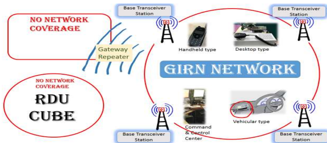
Fig.2. Component of GIRN in Malaysia

In Malaysia, there is an exclusive system Government Integrated Radio Network (GIRN) as an alternative for communication during disaster [39]. This radio network was made to have limitless network availability with high security encryption. The aims of this system are generally to provide a system that is resistant to any climatological factors with minimal infrastructure dependent. The radio network is a shared network between multiple agencies but each agency is able to maintain their independence and autonomy of their own communication system [40]. Agencies involved in the networking are the national security, fire and rescue, health, ambulance frontier guards and other related agencies such as transportation companies, airports and delivery companies. GIRN is capable to enhance its coverage to areas outside its coverage by using Trunked Mode Operation (TMO) gateway, Direct Mode Operation (DMO) repeater. Up to date, there are few ambulance and agencies' official vehicles being equipped with RDU/CUBE to provide temporary network coverage at sites beyond GIRN network coverage. All these features are very useful at time of disaster to ensure continuous communication between local population effected and the rescue team. Nevertheless, GIRN is still incapable of transferring data in image forms [41]. Fig. 2 summarizes the components of GIRN.