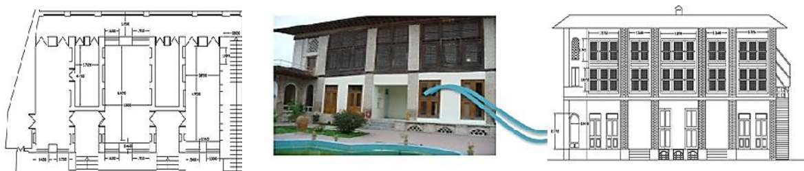
Fig.2. Home of Klbody