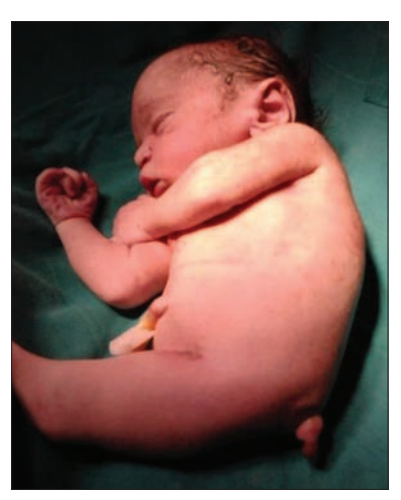
Figure 1: Shows the morphological appearance of the fetus with sirenomelia