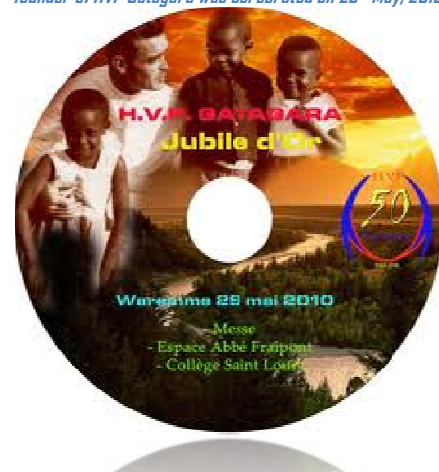
Figure 1: The 50 th commemoration of Fr Joseph Fraipont, the founder of HVP Gatagara was celebrated on 29 th May, 2010

It was in 1962, when a compassionate Belgian priest called Fr. Joseph Fraipont (1919-1982), deeply touched by the misery and difficulties the Rwandan children with disabilities lived in, founded HVP center for young Rwandans with disabilities at Gatagara, in the current Nyanza District of the Southern Province. Until late 1990s, it was the only center that cared, educated, and reintegrated physically and visually disabled persons in Rwanda. By 1979, Fr Joseph Fraipont, then Nationalized as Rwandan with the name ‘Ndagijimana’, had established and equipped a special school for children with physical and visual disabilities, and schooling for blind children begun in September 1979 at HVP Gatagara with a primary school section. It remained so until 1997 when G.S. Gahini opened its doors for their integration in secondary education. Before that, there had been no secondary level schooling for such category of learners in Rwanda, and