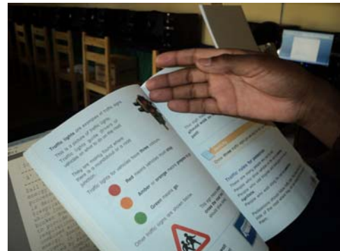
Figure 1: Teachers of HVP Gatagara indicating some of the sections of the school books that they find difficult to transcribe into Braille for VIS.

It was expected that the focus on the three key components of education practice encompasses issues related to special educational needs of visually impaired learners, and HVP-Gatagara-Rwamagana being the most