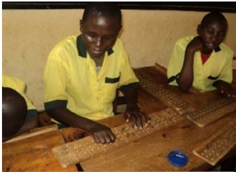
Figure 2: Visually Impaired Learners of HVP Gatagara-Rwamagana in their initiation to numeracy & literacy through tactile materials

According to Mani (1997), the term low vision means " marked reduced functional vision in an individual " and the visual condition may demand large print materials and magnifiers for reading. On the other hand, blindness refers to complete loss of vision that cannot be corrected by any optical instruments. Accordingly, students with Visual