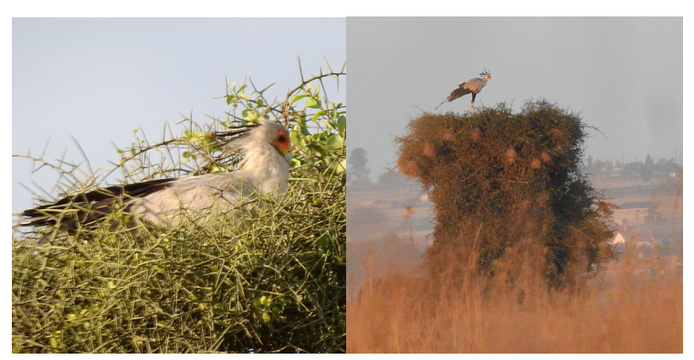
Figure 5. Secretarybirds Sagittarius serpentarius on nests in NNP, 5 May 2018-left, and 12 Aug 2018-right.