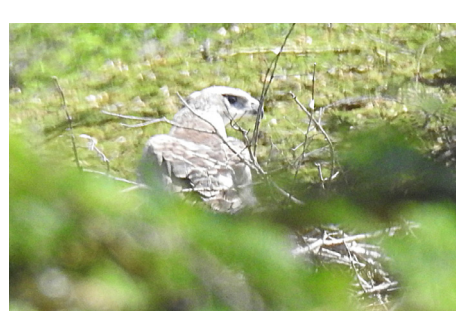
Figure 10. Juvenile Martial Eagle Polemaetus bellicosus in KIPETO, 23 November 2017.

It is widespread, but rarely seen in KITENGELA and ISINYA. There is one nesting pair in NNP, two nesting pairs in KAPITI and two nesting pairs in KIPETO. Only one nest is outside a protected area. This nest is within the Kipeto Wind Power site