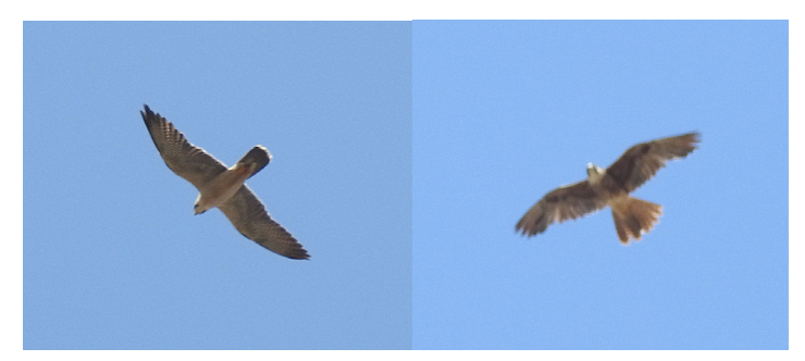
Figure 3. Lanner Falcon Falco biarmicus adult (left) and juvenile (right). KITENGELA, 5 September 2018.

The most common and widespread falcon. It was seen in several locations, but only one definite pair was recorded in KITENGELA, where two adults were seen flying together with a juvenile. This species likely nests along the Rift Valley escarpment. Sightings of juveniles and hunting adults in KAPITI suggest that a pair or two are likely resident around Lukenya, Kapiti and/or Mwambi hills, but no conclusive evidence for this was found.