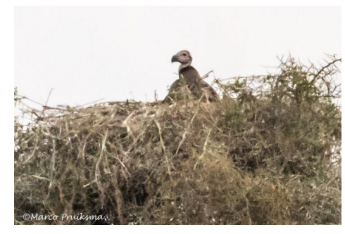
Figure 8. A juvenile Lappet-faced Vulture Torgos tracheliotus in the nest in NNP, 2 October 2018.

A widespread and common species. Three pairs were recorded in KIPETO, two in Ol-