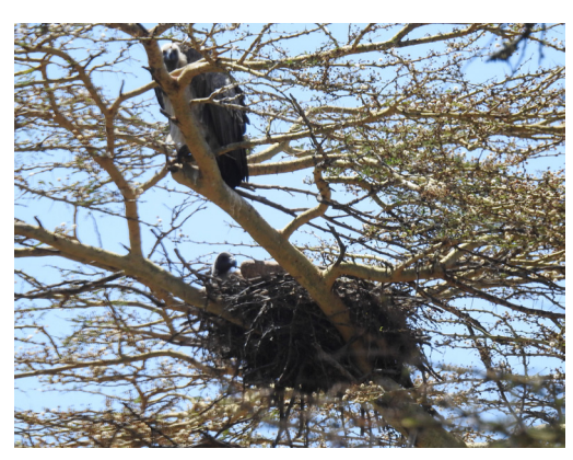
Figure 7. A pair of White-backed Vultures Gyps africanus at their nest in KAPITI, 11 September 2018.

the Ol-Kejuado and Oloyiangalani rivers show that this species previously had a few other nest sites in KIPETO until very recently. Human disturbance and cutting of large trees seems to have driven them from these breeding sites. Illegal logging has been documented at Olerai and is a continued threat to the breeding colony. Potential natural gas exploration at Olerai is also a threat. Retaliatory poisoning of large carnivores has not been reported often within the study area, but livestock depredation, mainly by spotted hyena and leopard, but also by lion, cheetah and African wild dog is a frequent occurrence in all zones except NNP (S. Shema, unpub. data). The potential to