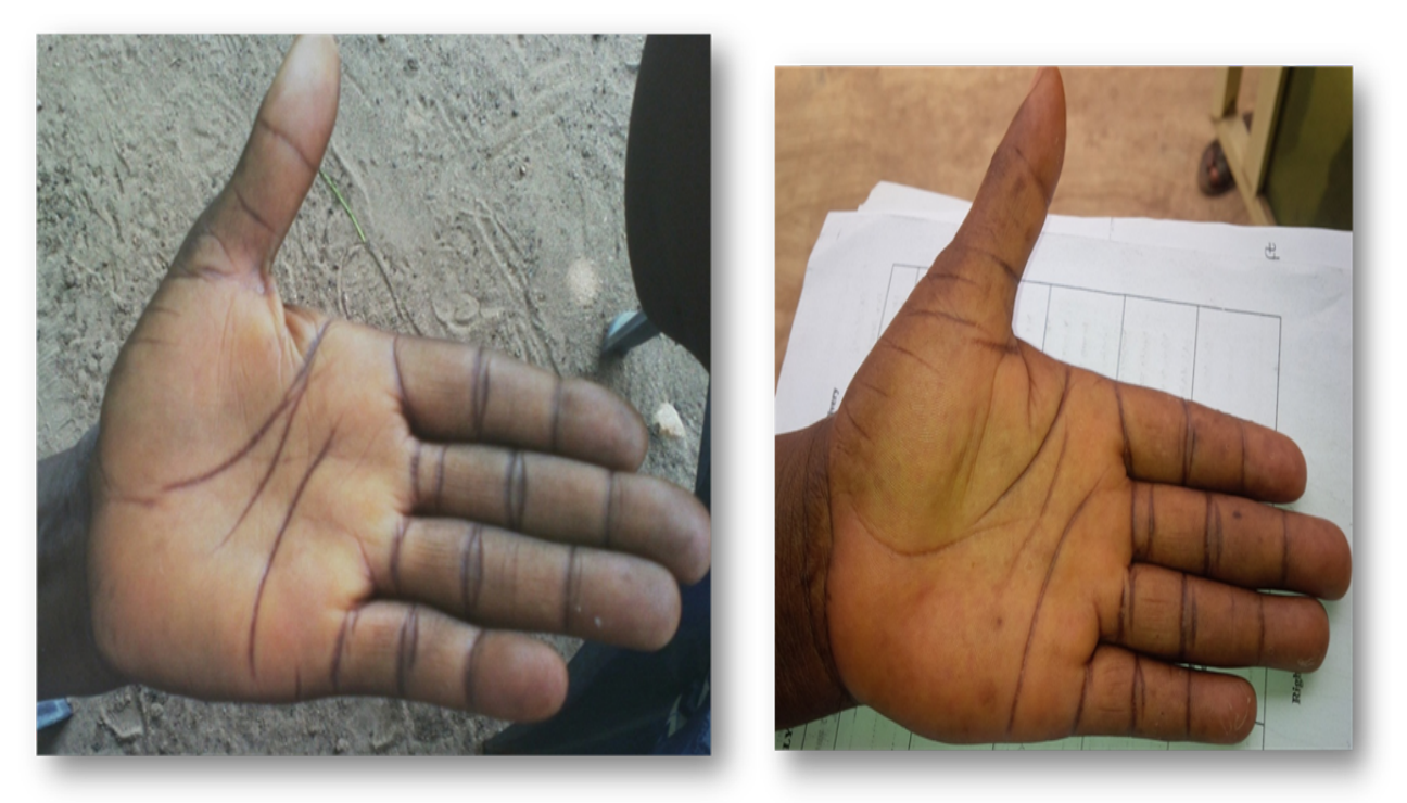
Figure 3: Picture of the left hand of two women showing different PIC criteria