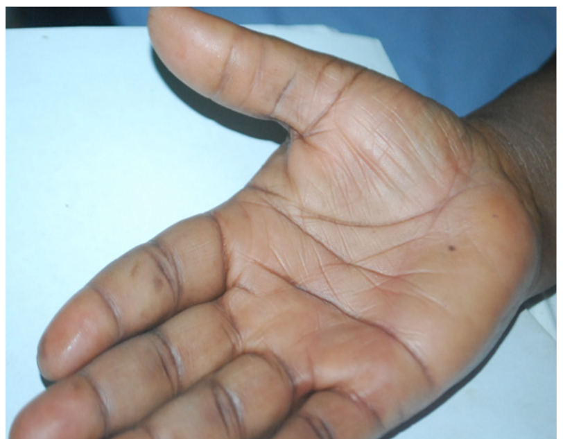
Figure 2: Right hand of the woman showing three palmar lines with intersection