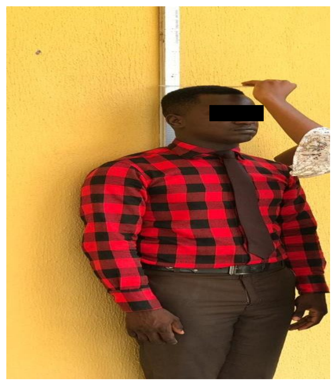
Figure 3: Measurement of the height using a stadiometer.