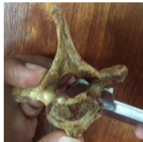
Figure 2: Posterior pedicle measurement technique

The narrowest pedicles in the thoracic spine were found at T4, T5 or T6; while the widest were found at T10, T11 or T12. Table 1 below shows the average diameters and standard deviations (SD) calculated from the three measurements for each pedicle from the five cadavers. Generally, the SD was higher for narrower pedicles compared to wider pedicles.