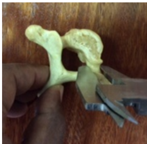
Figure 1: Anterior pedicle measurement technique

three times. The specimens were numbered from 1 to 5. The order of individual thoracic spine specimen measurement was determined randomly by use of a box from which the numbers 1 to 5 were drawn by the co-investigator. The first author then sequentially measured the right pedicle of the first thoracic vertebrae down to the twelfth thoracic vertebra, using the same Vernier caliper. The measurements were recorded to the nearest 0.1mm. The same measurements were done for the other specimens until all five were complete. The procedure of randomization was done again and the specimens re-measured.