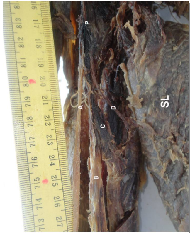
Figure 3: Sciatic nerve terminal branches (A, B, C and D) supplying posterior leg muscles. P, popliteal fossa (lower angle); SL, soleus muscles (reflected left)