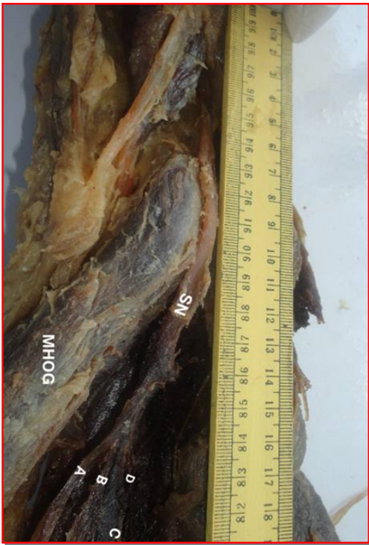
Figure 2: Sciatic nerve dividing into four terminal branches — A, B, C and D 16cm from the superior angle of the popliteal fossa. MHOG, medial head of gastrocnemius muscle; SN, sciatic nerve