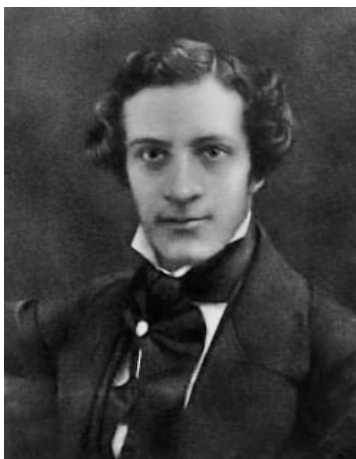
Henry Gray (1827 -1861),