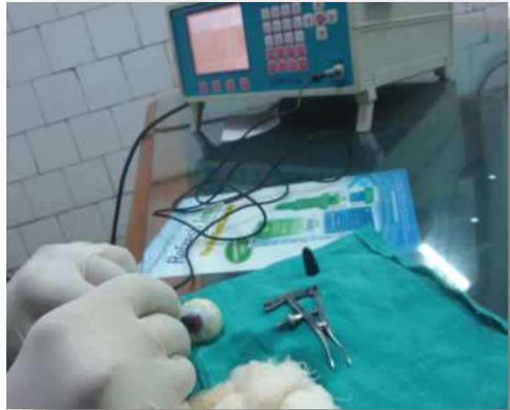
Figure no 5: Axial Length measurement by Ultrasonic A Scan