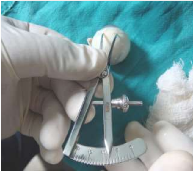
Figure no 4: Measurement of distance between rectus muscles insertions