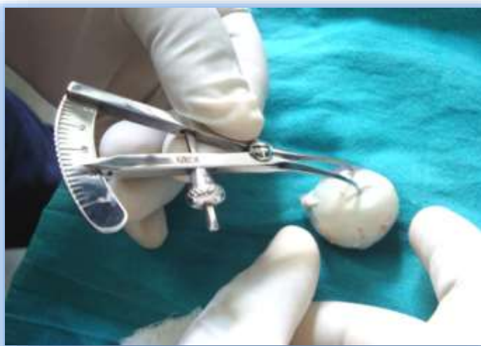
Figure no 2: Measurement of distance between limbus to midpoint of rectus muscle insertion