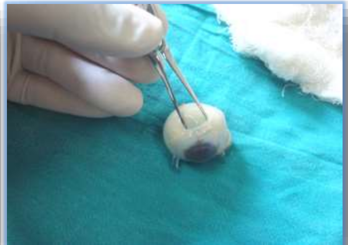
Figure no 3: Measurement of length of line ("width") of rectus muscle insertion.