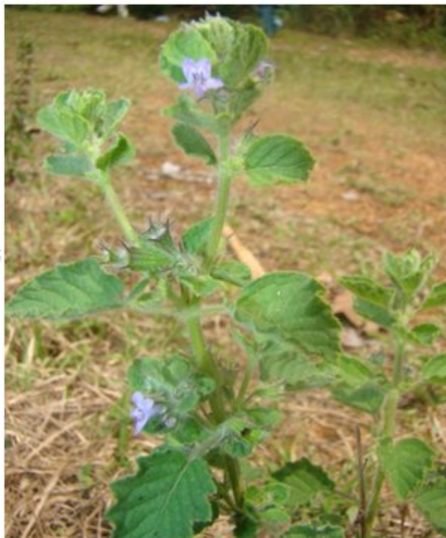
Fig. 1: Habit of Hyptis suaveolens (L.) Poit.