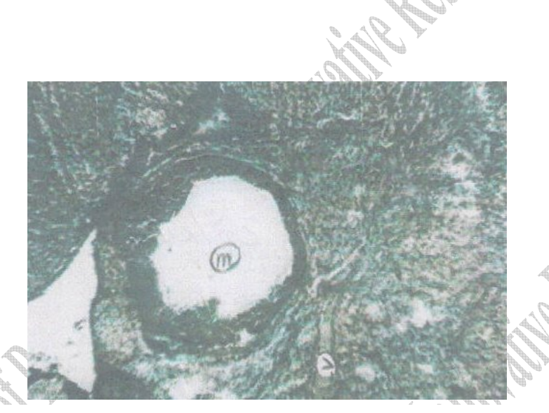
Plate 3. Transverse section of term planceta x4000. Showing part of vasculatyre (v) surrounding a central mucous area (m)