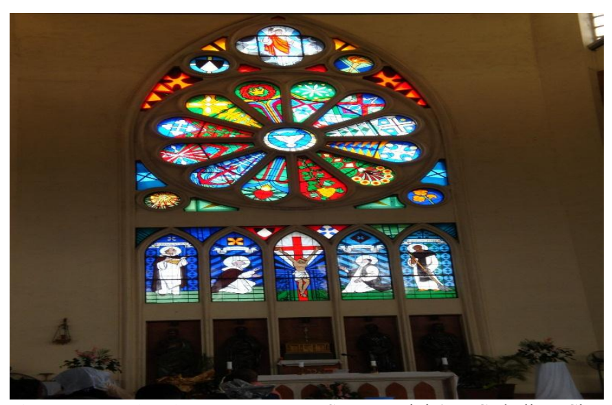
Fig.2: Stained glass paintings, St. Dominic's Catholic Church, Lagos. Yusuf Grillo, Plexiglass & Pigment, 1360x 680, 1963.