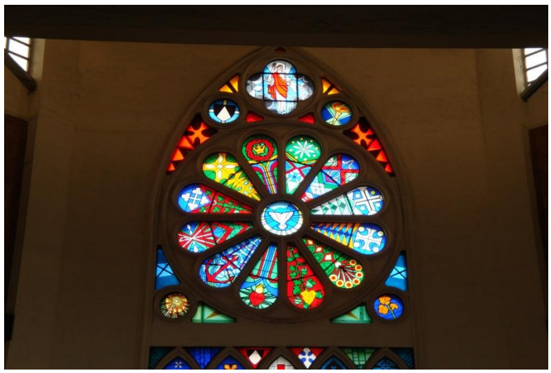
Fig. 3: Stained glass painting (detail of upper section), St Dominic's Catholic Church, Yaba, Lagos, Yusuf Grillo, Plexiglass & Pigment, 1963.