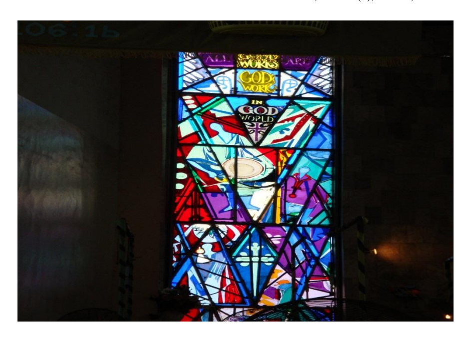
Fig. 1: Celebration, Yusuf Grillo, Plexiglas, 214x 334, 1962. © Nelson Graves.