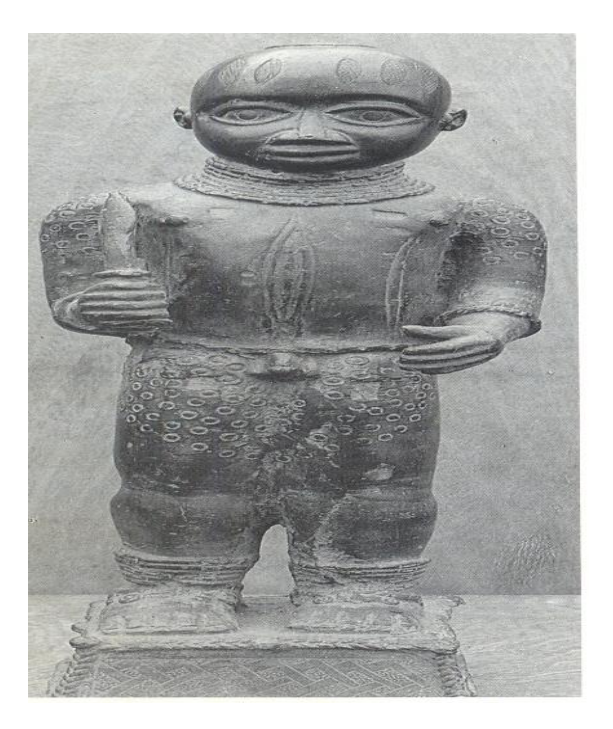
Fig. 1: A Brass Image of Ise ne Utekon

Another commemorated incident also involving Oba Ozolua is the conflict between him and Egbaen, the powerful ruler of Iwu, a town in Benin. Oral history reports that during one of their conflicts the rebel ruler captured the Oba and imprisoned him.