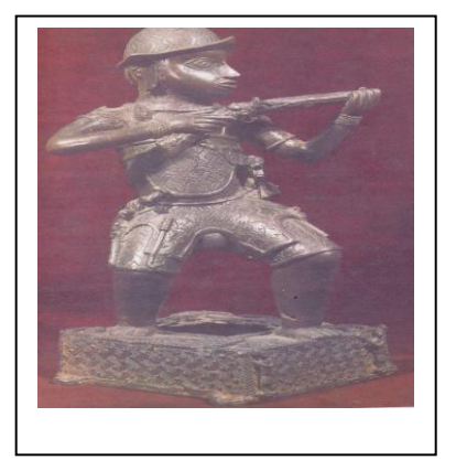
Fig.2 Portuguese Warrior

Portugal read in part, "the missionaries went with the King of Benin to war and remained a whole year; the King could not do anything until the war was over" (qtd. Egharevba: Ibid). The Obas also personally participated in the wars and commanded the Benin Army until Benin military commanders abolished the Oba's right to command during the reign of Oba Ehengbuda in late sixteenth century (Duchateau, 1993). The life and war exploits of Benin Kings are dominant themes in Benin commemorative art. Some welldocumented examples are the war escapades of the Obas of the fifteenth and sixteenth centuries whose main focus was on the expansion and defense of Benin kingdom. Notable amongst these are the wars fought by Oba Esigie (1504) as exemplified in the legendary battle against the Attah of Igala, North of Benin. Themes that immortalize these wars, and which proclaim the military might of Benin Obas and their Army include: Benin kings and warrior chiefs in battle gears wielding long cutlasses or swords (Umozo), spears (Ogan), and bows and poisoned arrows. There are also figures of the Portuguese mercenaries who aided them in some of their battles who are depicted dressed in European clothing and holding European weapons (Fig.2). Generally, these artforms evoke and immortalize Oba Esigie's battle victories, and on a broader level, those of other Benin Kings. They underscore the martial might of Benin Kings and are meant to deter political revolts against the Oba.