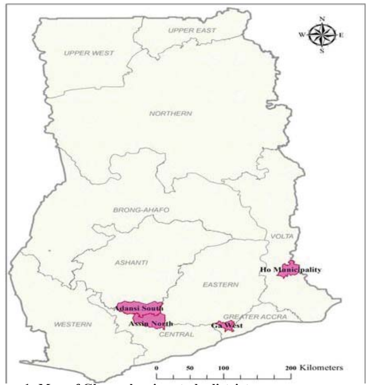
Figure 1: Map of Ghana showing study districts