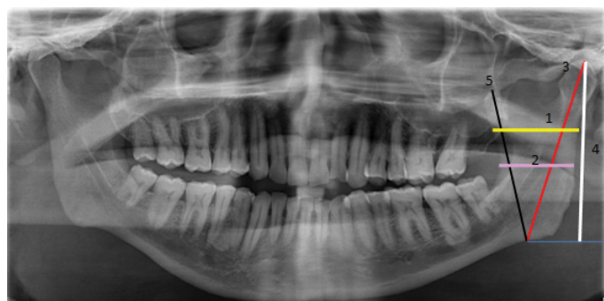
Figure 1: Digital orthopantomograph (OPG) showing mandibular ramus measurements.

Variable D: Projective height of ramus: Distance between the