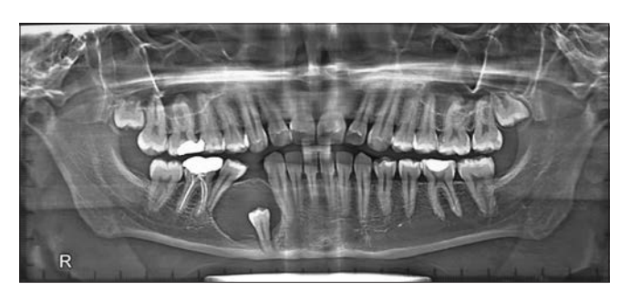
Figure 1: Orthopantomogram revealed a well-circumscribed radiolucency involving right mandibular first premolar and displacing the roots of adjacent teeth

On microscopic examination, a large cystic space lined by 2–4 cell thickness, nonkeratinized stratified squamous