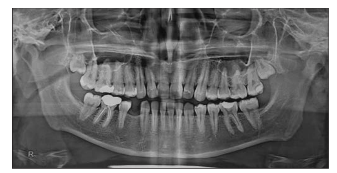
Figure 4: One-year postoperative orthopantomogram revealed adequate healing and near normal alignment of the previously displaced roots of adjacent teeth

The extrafollicular type commonly presents as a well-defined, unilocular radiolucency found between, above or superimposed upon the roots of erupted, permanent teeth, which often leads to the preoperative, tentative diagnosis of a residual, radicular, globulo-maxillary or lateral periodontal cyst depending on the actual intraosseous site of the lesion. The cut surface may reveal a solid tumor mass or show one large or several small cystic spaces containing a yellowish, semi-solid material with an unerupted tooth found embedded in the tumor mass or projecting into a cystic cavity. From the foregoing, it is evident that most AOTs do present as cystic lesions clinically and pathologically whether follicular or extrafollicular. In addition to their presentation, there are various reports which claim the origin or association of an AOT with a cyst or cystic neoplasm which is discussed in the following section.