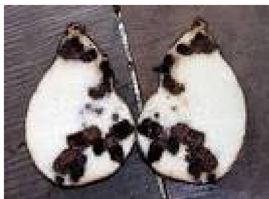
Figure 3: Picture of a yam damaged by nematode infections