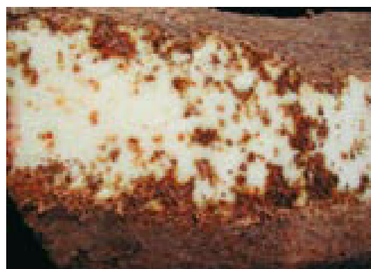
Figure 4: picture of internal lesion and necrosis caused by nematodes on a yam.