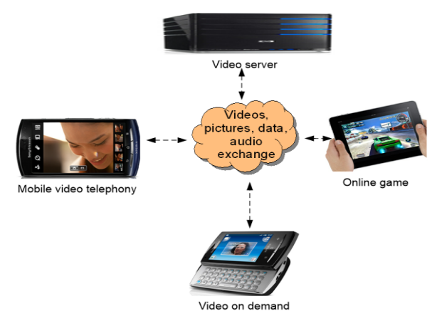
Figure 1: Typical wireless video networking system architecture.

exploitation of the media motion characteristics of