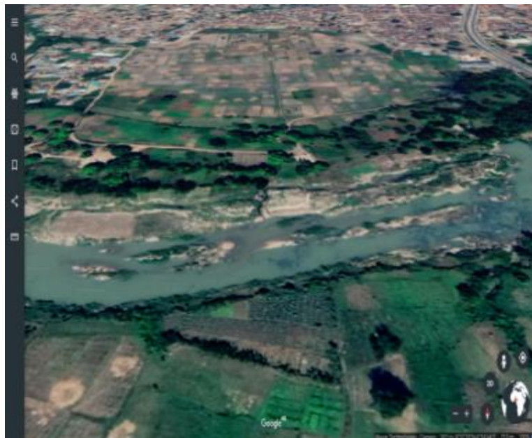
Figure 2. 3D view of the irrigation scheme using Google earth 2019