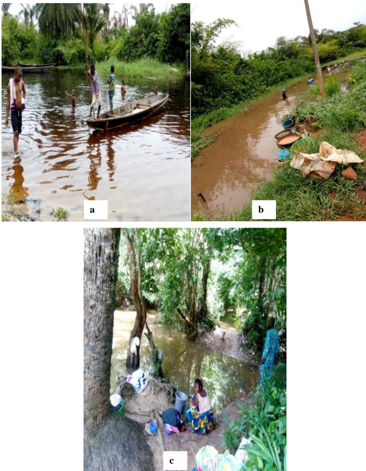
Figure 1: Different human activities in the water bodies sampled