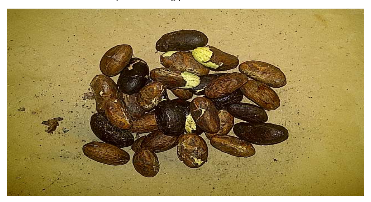
Plate 4: Garcinia kola seeds preserved in clay pot.

Seed shrinkage is associated with loss of moisture i.e. the more the moisture content reduces, the more the seeds shrink. This is not a different situation as it is evident in this study that the treatment that shrank most is the treatment that lost the most