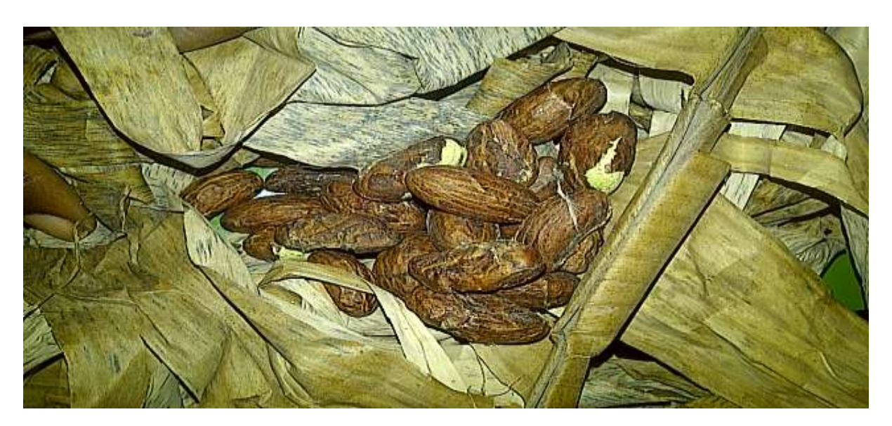
Plate 3: Garcinia kola seeds preserved using plantain leaves.