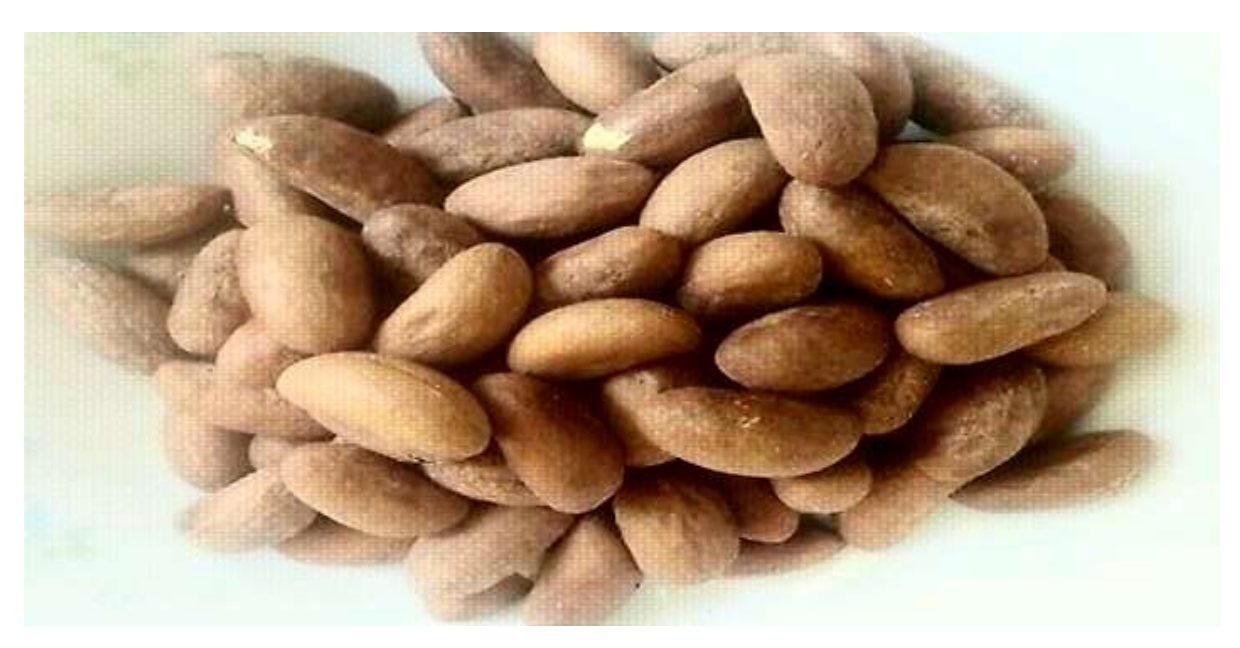
Plate 1: Garcinia kola seeds before preservation.