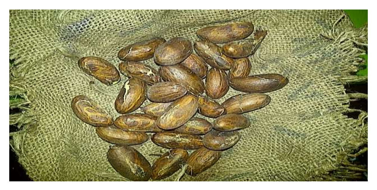
Plate 2: Garcinia kola seeds preserved using jute bag.

Although, seeds preserved in jute bags that was ranked second in terms of its ability to preserve moisture also was observed to retain its normal brown colour after 8 weeks, seeds preserved using sandy soil