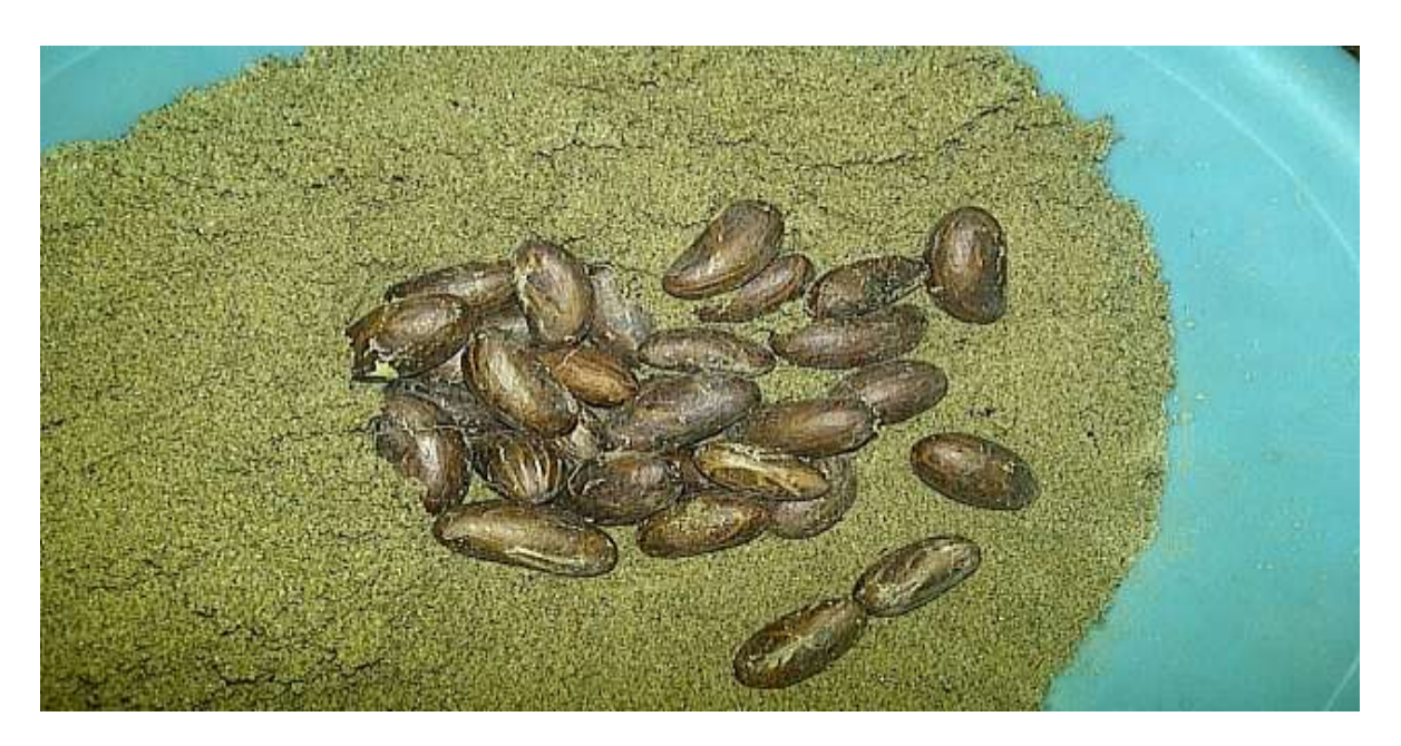
Plate 5: Garcinia kola seeds preserved in sandy soil.

of 33.6% of its total weight. As seen above, the moisture content of Garcinia kola comprises more than half of its total composition, therefore a reduction in the moisture will be evident in the level of shrinkage.