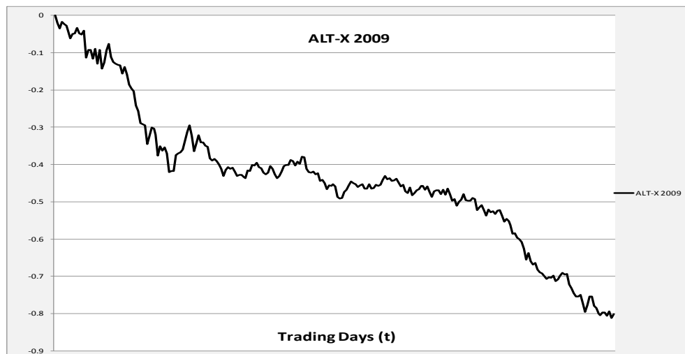
Figure 1: ALtX performance during 2009