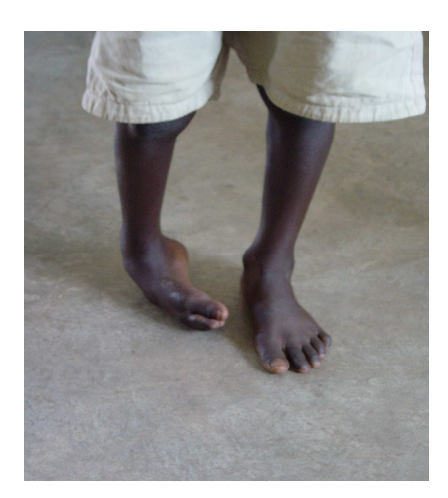
Figure1. Deformity due to post injection deformity.