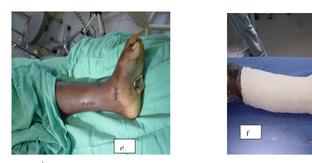
Figures 2 a-f showing the Anterior Transfer of Tibialis Posterior technique.

The first is made on the medial side of the foot through which we detach the whole tendon from it insertion, the second is at the level of musculotendinous junction where rerouting as well as fractional tendoachilislengthening in cases with equinus less than 10 degrees were done and lastly an incision is made over the cuboid. A tunnel is created with an artery forceps from the third incision to the second through interosseous membrane into which the tendon is passed.