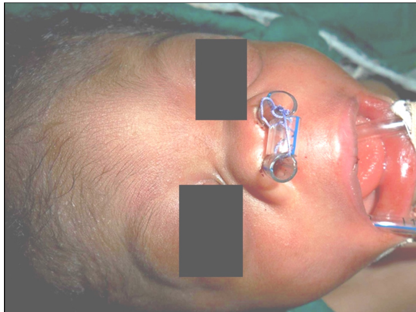
Figure4. Photograph showing nasal stent in-situ after repair

Nasal examination revealed flat nasal bridge. No patency was demonstrable bilaterally. Using nasal catheter FR 6, patency test revealed obstruction to passage at 2cm on the right and at 2.7cm on the left from the nares, thereby making suspicion of bilateral choanal atresia (BCA) very high. Nasal endoscopic examination was however deferred till the baby was relaxed under general anaesthesia. The heart sounds were normal with no murmurs and the heart rate was 120/min. Other systemic examinations revealed hypoplastic penis but essentially normal abdominal findings.