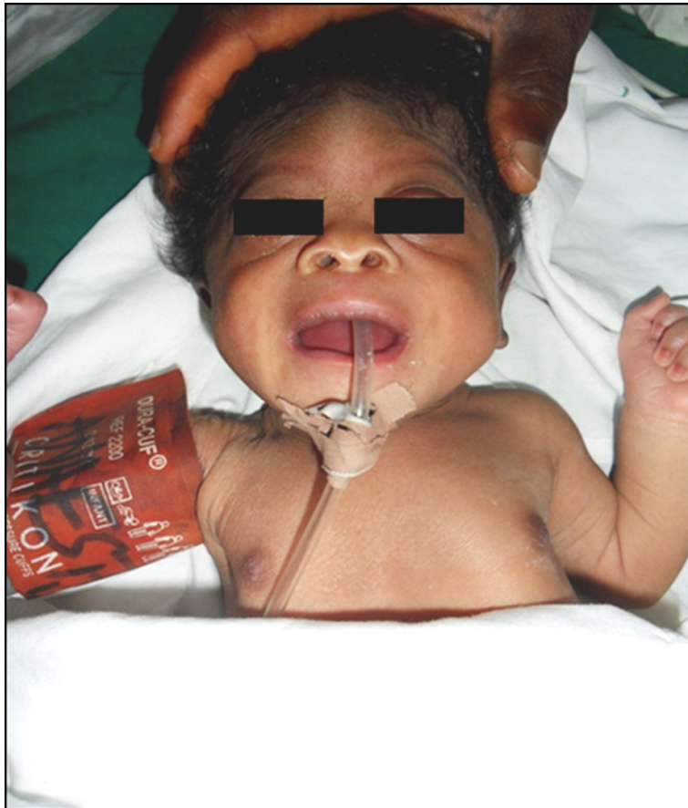
Figure 1. Photograph of the baby showing orogastric tube in-situ to keep the oropharynx patent for airway

microcephaly, hypertelorism, bilateral proptosis, low set ears, micrognathia, microglossia and flat face. Body temperature was 36.7° Celsius.