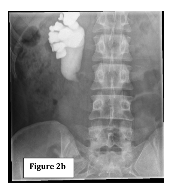
Figure 2a & 2b.. Retrograde pyelography.