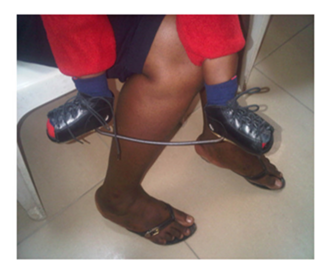
Figure 1. Steenbeck foot abduction brace

Six feet required open elongation of the tendo-achilles, three of which also had posterior capsulotomy. Relapse was observed in 8 feet (5.16%) within one year, and all these patients did not use the foot abduction brace as prescribed. Cast complications (blisters, ulcers and skin rashes) were found in 9 feet, two of which had to be left out of cast for one week each. The foot abduction brace was used as prescribed in only 60 patients (56.8%). Reasons given for not wearing the brace as prescribed included mother's embarrassment, lack of funds, babies' discomfort and removal of braces by the older children