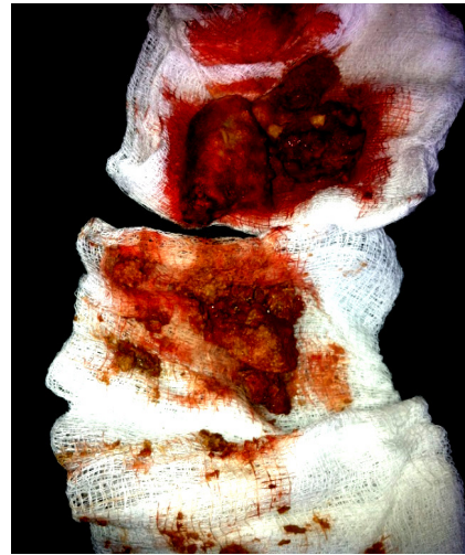
Figure 3. The removed Crashed Stone