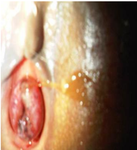
Figure 1. Circular, oedematous interlabial mass.

Histopathological examination of the specimen showed an almost round, firm, greyish tissue measuring 1.1 x 0.9cm and weighing 0.3g. There was a lumen in the central area of the tissue measuring 0.5cm in its widest diameter. Microscopy showed seemingly polypoid tissue covered in parts by transitional to non-keratinised stratified squamous epithelium. The stroma was loose, oedematous and contained many thin walled vessels of varying sizes. Some vessels were tortuous, few were close to the overlying epithelium with accompanying superficial ulceration and there was haemorrhage and thrombosis of the superficial vessels. The stroma was infiltrated by lymphocytes, plasma cells and eosinophils. Some peri urethral glands were noted. A pathological diagnosis of capillary hemangioma compatible with prolapse of the urethra was made.