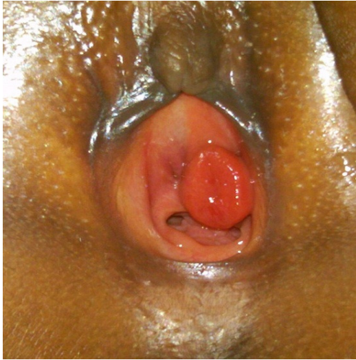
Figure 3. Doughnut shaped mass at the urethral orifice.