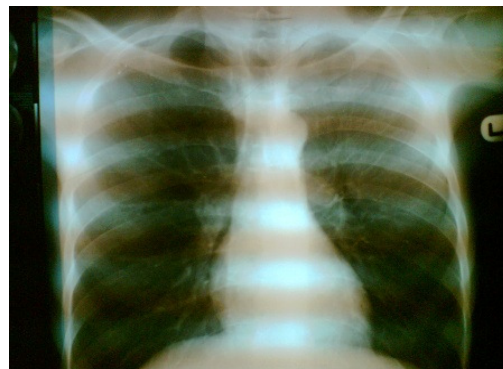
Figure 4 Chest x-ray.

Incisional biopsy was done and the specimen taken for Z-N stain and histology. Z-N stain revealed acid fast bacilli ( Mycobacterium tuberculosis ) and histology revealed Langerhan's giant cells with area of caseations. The patient was initiated on antituberculous medication for 12 months.