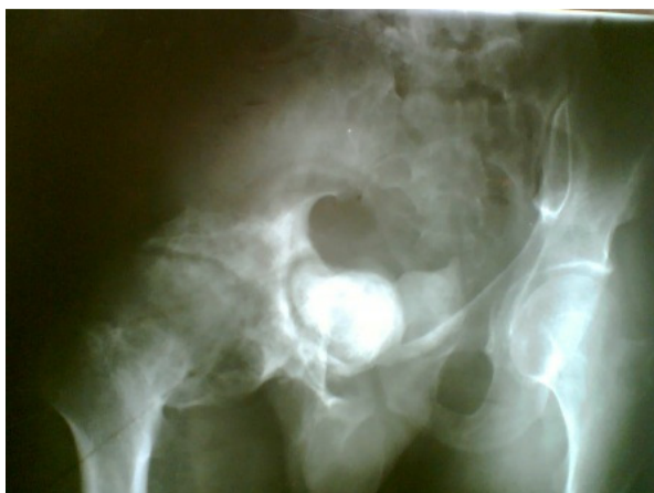
Figure 1 AP Pelvic Radiograph