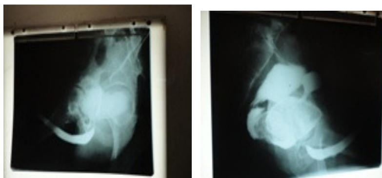
Figure 2 Cystourethrogram.

Abdominal u/s revealed mild bilateral hydronephrosis the other abdominal organs were normal. Pelvic X-ray fig.1 showed a calcific pelvic mass and a destructive lesion of the right hip joint. Cystourethrogram fig.2 revealed a Rectovesical fistula a result of erosion of the bladder, and associated chronic bladder outlet obstruction.