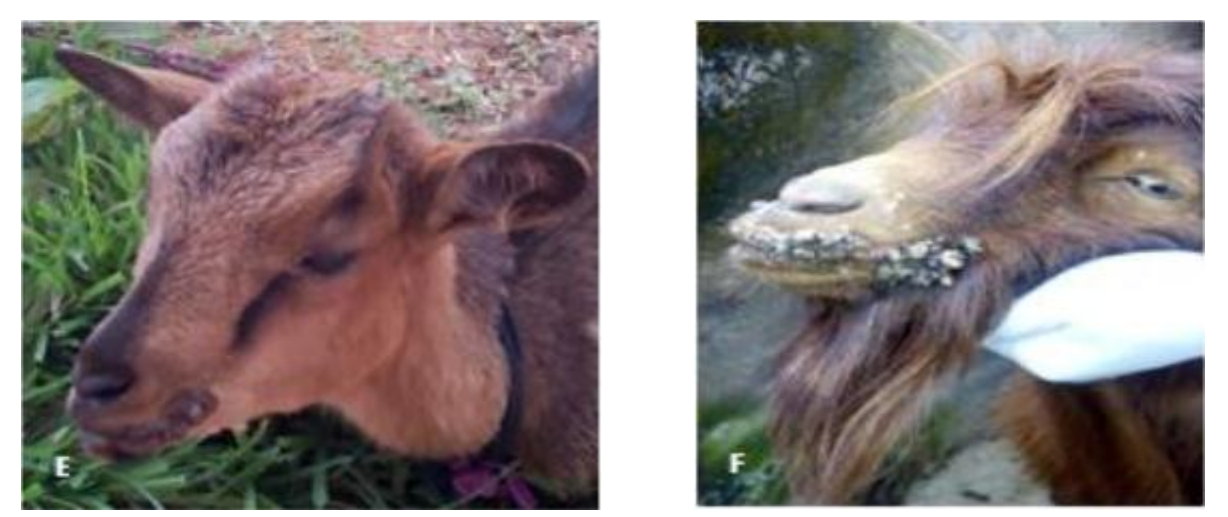
Plate IE-F : E : Scab lesion on the lips of a West African Dwarf goat from the second flock. F : A Kano Brown goat with cauliflower like proliferative lesions of contagious ecthyma on the lips of the only goat affected in the third flock