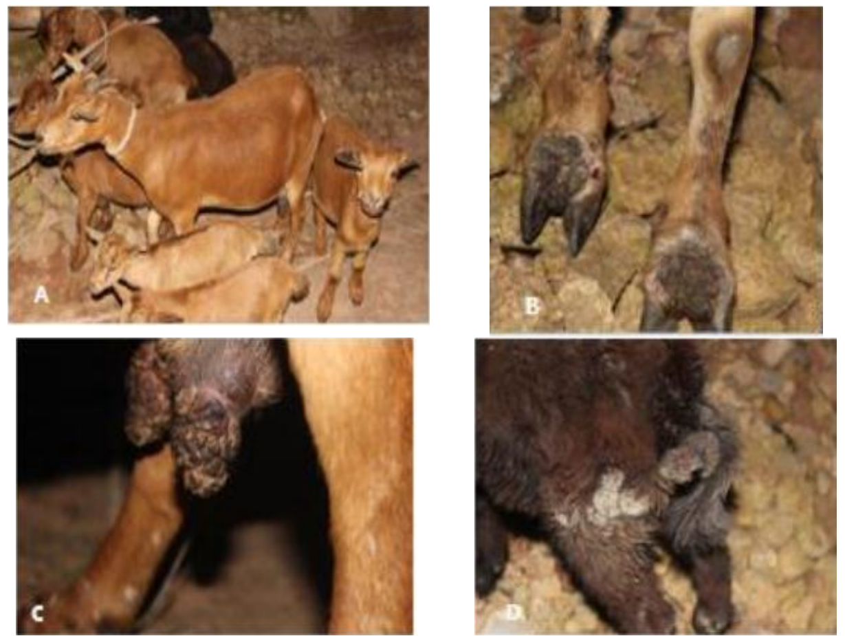
Plate IA-D : A : West African Dwarf goats with lesions of contagious ecthyma from the first flock, scab lesions on the lips of a doe and kids. B : Proliferative lesions of contagious ecthyma between the interdigital space of the hoof of one the goats in the first flock. C : Proliferative lesions on the teat of the udder of doe in the first flock. D : Proliferative lesions of contagious ecthyma on the hind leg of a West African Dwarf goat in the first flock.

Figure 1- A: Agar gel electrophoresis of polymerase chain reaction product of A32L gene of orf virus. Lanes 1-3 are the representative scab samples from the flocks, positive samples were amplified at 1098 bps. +ve is the positive control while –ve is the negative control. B : Agar gel electrophoresis of polymerase chain reaction product of B2L gene of orf virus. Lanes 1-3 show the representative scab samples collected from the flocks; positive samples were amplified at 1210 bps. +ve is the positive control while –ve is the positive control while –ve is the negative control while –ve is the positive control while –ve is the positive samples were amplified at 1210 bps. +ve is the positive control while –ve is the negative control