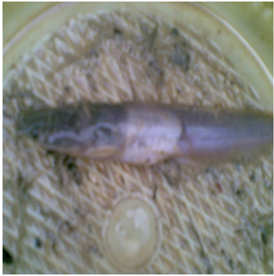
Plate II. An infected fish showing gray band of skin discoloration