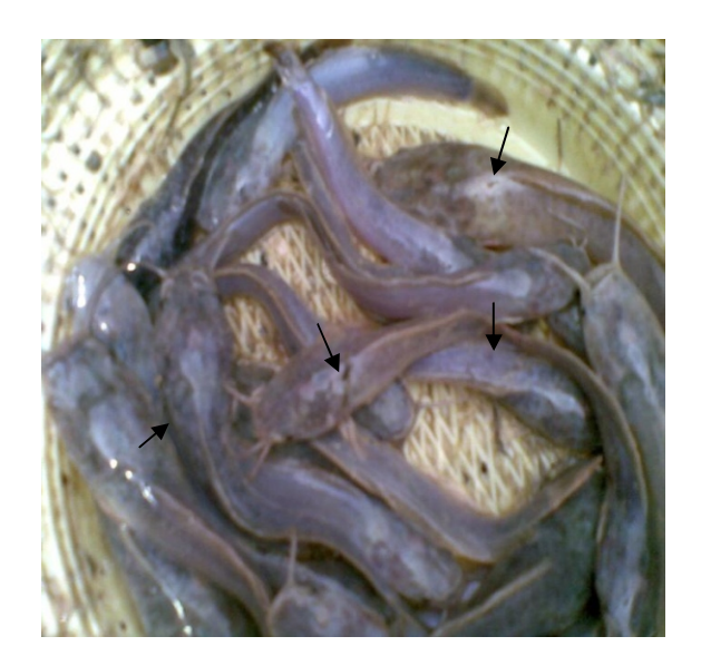
Plate I : Surviving Fishes with numerous marbled hemorrhagic and necrotic patches

Liming fishponds with either agricultural lime ( CaCO_3 ), Slaked lime ( CaOH_2 ), or Quicklime CaO at recommended doses serve as excellent pond disinfectant (NIFFR, 2001), helps to increase soil alkalinity, eliminate pathogens, parasites, and invertebrate predators, while waiting period of 1-2 weeks be allowed for pH to stabilize to 6.5-8.0 before refill (Haruna, 2003).