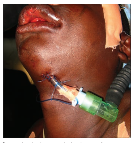
Figure 3: Orotracheal tube tunneled submentally

up to 10 days.<sup>[19]</sup> In a review, submental intubation was found to be safe, but increased tracheal pressure, as a result, of deviation and compression of tube was observed.<sup>[21]</sup>