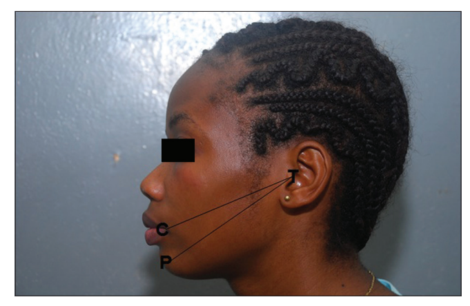
Figure 1: Measurement of facial width. T - tragus, C - commisure, P - pogonium

All the surgical procedures were performed by the same surgeon using the guttering technique. A local anesthetic agent (2% lidocaine with 1:100,000 adrenalin) was administered to all patients using a dental syringe and a 3.5 cm long 27 gauge dental needle through an intraoral approach. A full thickness three sided buccal mucoperiosteal flap was made and reflected with an anterior relieving incision running from the buccal sulcus to the midpoint of the first or second molar depending on the nature of impaction and continued through the gingival sulcus of the second molar. The posterior incision was made distally and laterally over the external oblique ridge in the retromolar ascending ramus area. Bone was removed using a round bur (carbide no: 8) in a high speed straight hand piece under constant irrigation with sterile normal saline solution. The delivery of the tooth was carried out with tooth division done where indicated.