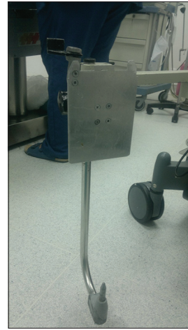
Figure 2: Jostra (MAQUET) oxygenator holder