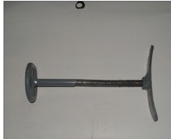
Figure 4: T-shaped side arms which grip the oxygenator within the circular main frame at 2, 5, 7 and 11 O'clock positions