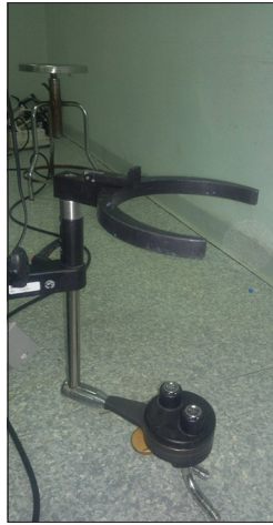
Figure 1: Dideco (EVOS, EOS) oxygenator holder