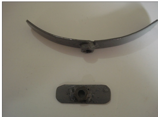
Figure 5: Two crosses of the T-shaped side arm (a straight and a curved)

include, (i) it requires some time to fit, (ii) extreme caution is required in fitting the oxygenator to avoid breakage, (iii) a spanner is required to lock the latch.