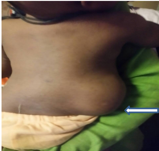
Figure 1: Mass of 6cm x 10cm occupying the right flank

A 6-month old female infant was presented with a swelling in the right lumbar region, which was noticed by the parents at birth. The swelling was initially small but gradually increased to attain the current size which became more prominent up on crying and decreased while in supine position. On examination, there was a globular painless swelling, 6cm x10cm in size, which was soft and reducible below the right costal margin lateral to the dorso-lumbar spine. Bowel sound was heard over the mass (Figure 1). X-ray of the chest showed absent ribs (T10, T11) on the right side with hemi-vertebrae. There was also scoliosis with convexity to the left and overcrowding of the ribs on the right chest on the chest X-ray (Figure 2). Ultrasound of the abdomen showed hernial defect in the right lumbar region measuring 4.5cm x 2.9cm, containing bowel loops and right ectopic kidney, which was visible on the right hypogastric area in other words fused kidney on the right side. CT scan also showed crossed fused kidney (ectopic kidney) on the same side with the hernia sac, containing bowel and the right lobe of the liver. It also showed absent ribs (T10, T11) with right hemivertebrae of the corresponding vertebral bodies on the same side (Figure 3). Renal function tests showed normal values creatinine-0.4mg/dl and BUN-16.1mg/dl.