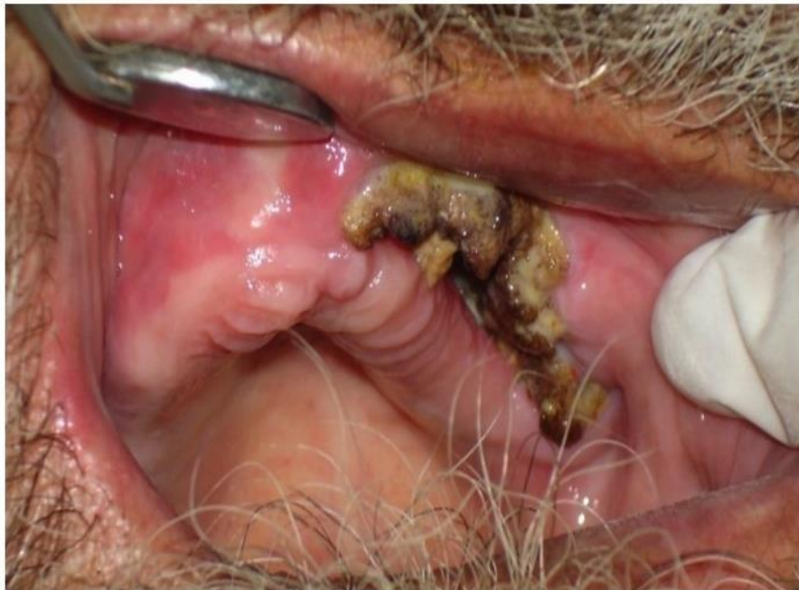
Figure 2: Intra-oral photograph showing necrosis of mucosa and underlying bone in relation to canine to tuberosity area of left vestibular region of maxilla along with abnormal communication b/w vestibule and palate.