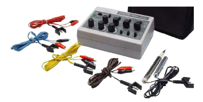
Figure 1 EMS equipment.

Assessment of occurrence of ICUAMW was done through the MEDICAL RESEARCH COUNCIL SCALE (MRCS)