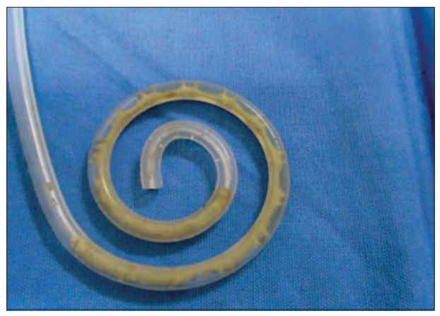
Figure 3: probable fungal mass in the lumen of a removed Tenckhoff catheter