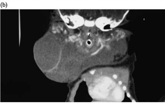
(a) Computed tomography with contrast at 1 day of age showing a large multilocular cystic mass more sizable at the right side. The right and left masses are connected together in the midline. There were multiple enhancing internal septations supporting the diagnosis of a lymphangioma. (b) A coronal view.