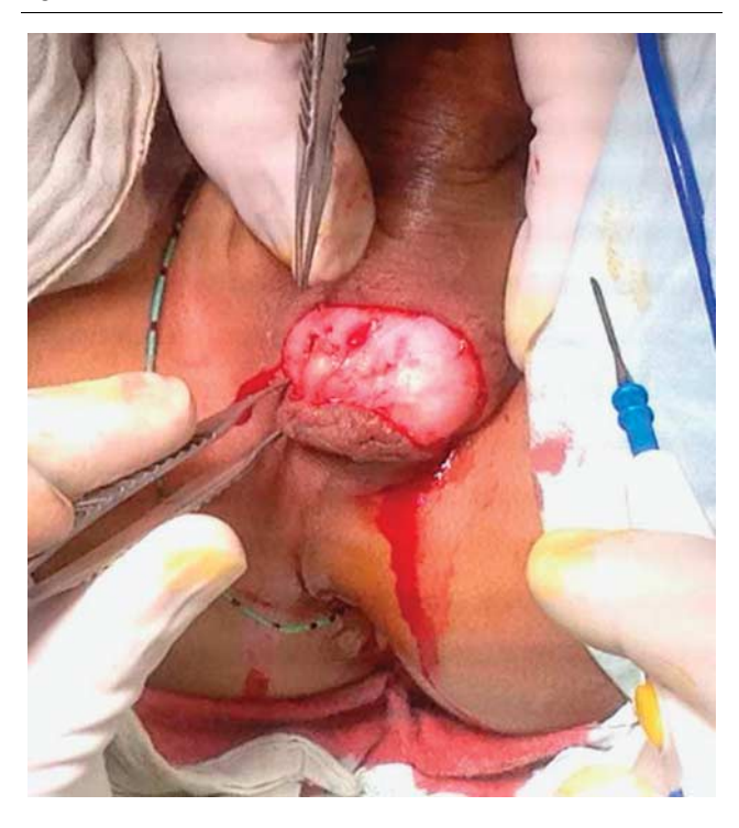
Cannulated urethro rectal channel