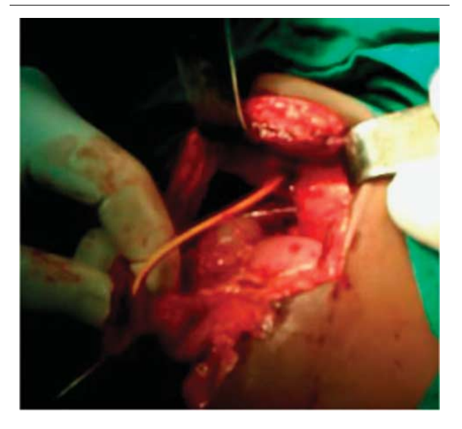
Peritoneal catheter of the shunt within the lumen of the ileum.

peritoneal cavity because of tight sealage of the openings by fibrosis.