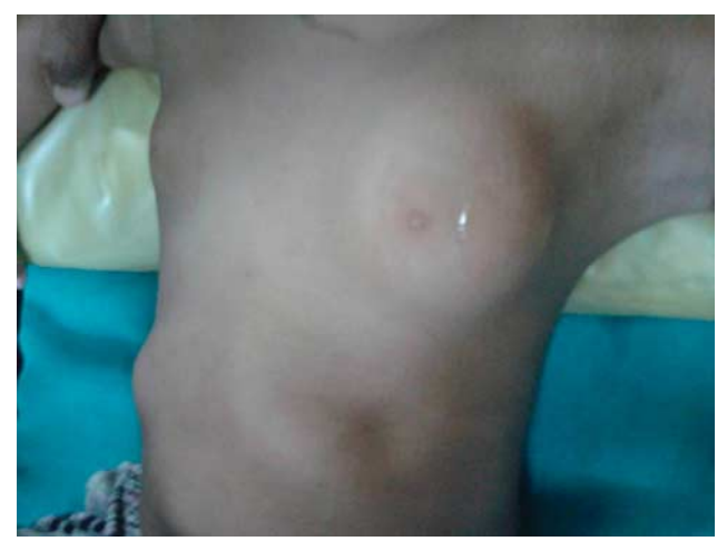
Cystic lesion in the left breast.