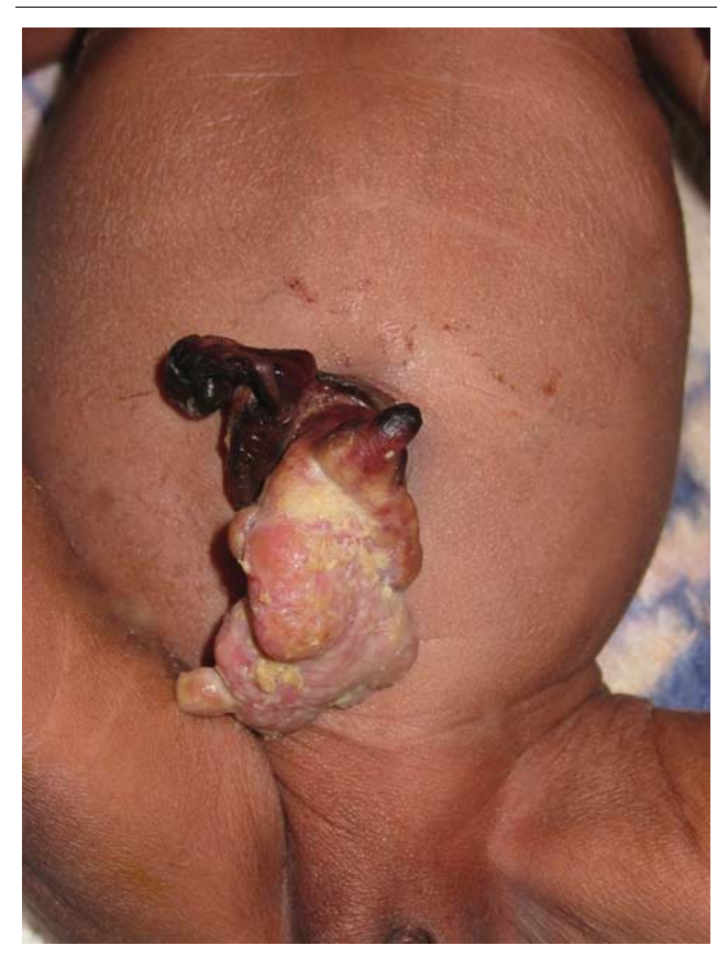
Inflammatory myofibroblastic tumor at the umbilicus of a neonate.