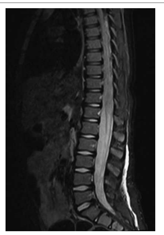
Sagittal STIR sequence MRI of the fluid collection in the subcutaneous plan.