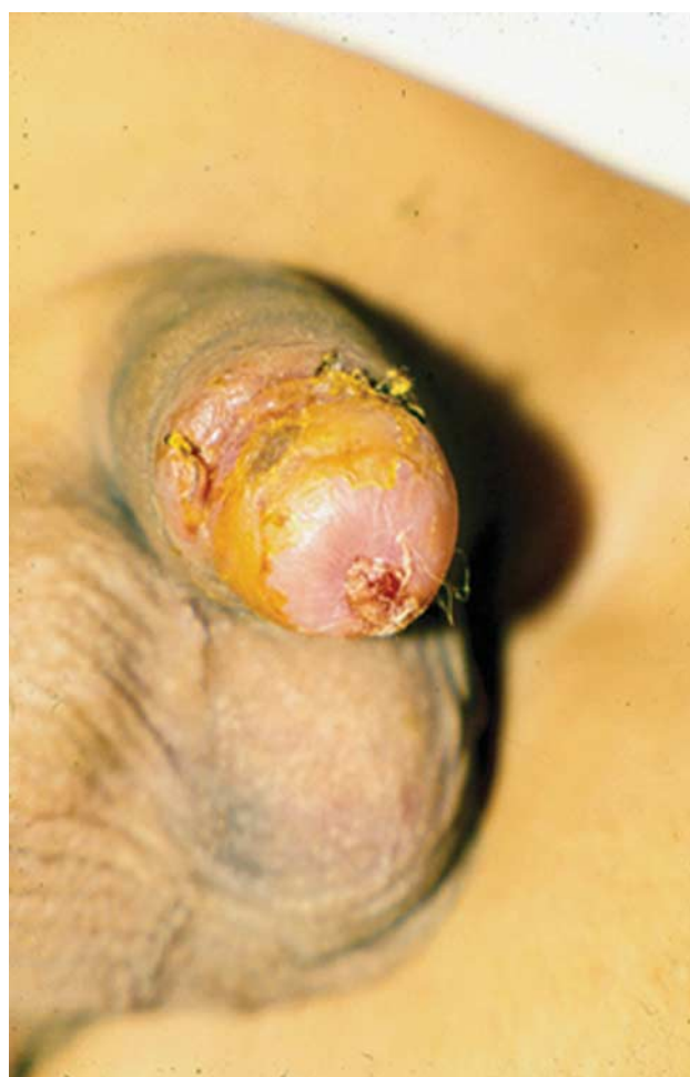
Properly located meatus at the tip of the glans penis after tubularized incised plate repair (highly satisfactory).

caliber, and achievement of satisfactory cosmetic skin coverage with a forward stream of urine (Figs 2 and 3).