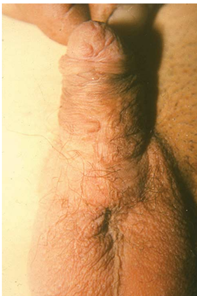
Disturbed urethral plate with a scar on a previously repaired crippled hypospadias.