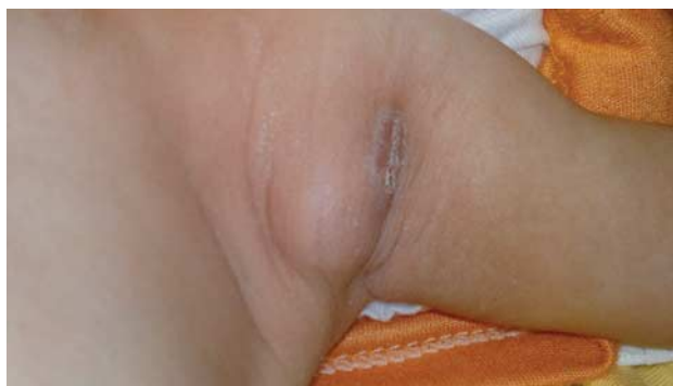
Bacillus Calmette-Guérin abscess.

was decontaminated with H 2 SO 4 5%, neutralized with distilled water, and inoculated onto two sets of four media, that is Lowenstein–Jensen (LJ), LJ with sodium pyruvate 0.5% (LJ-P), and selective mycobacterial growth indicator tubes as indicated by the supplier (Becton and