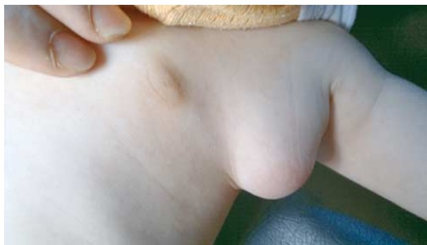
Post-Bacillus Calmette-Guérin axillary mass.